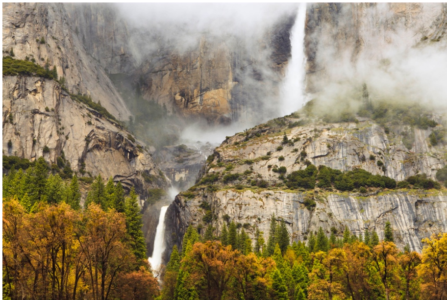
"Clearing Spring Storm" from The Nature of Yosemite: A Visual Journey

All sales of Yosemite Conservancy titles directly support Yosemite National Park. For more information, please visit yosemiteconservancy.org .